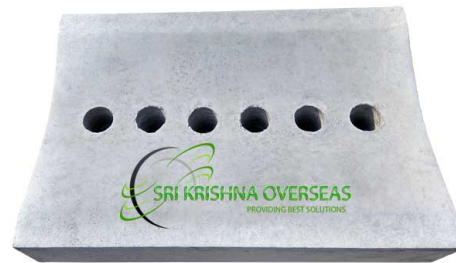
Saucer Drain Making Moulds 450 X 600 X 100