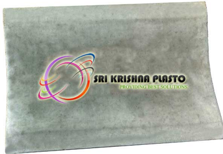
Saucer Drain Making Mould 410 x 600 x 100